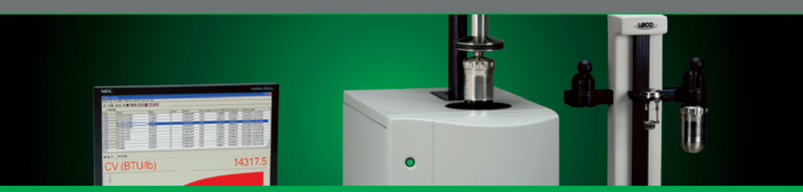
AC600 Semi-Automatic Calorimeter