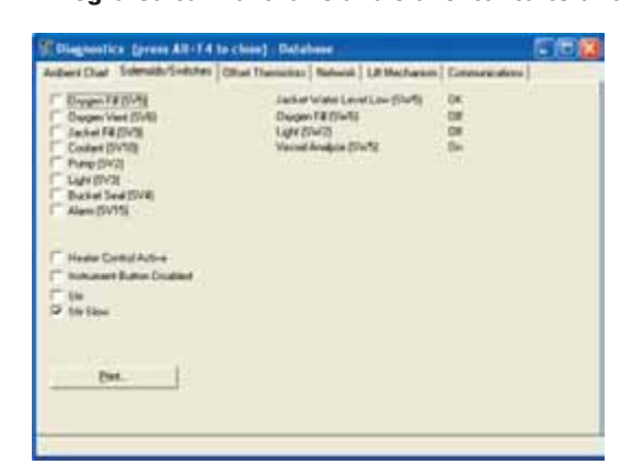
Expanded interactive diagnostic screens to aid in troubleshooting and improve serviceability