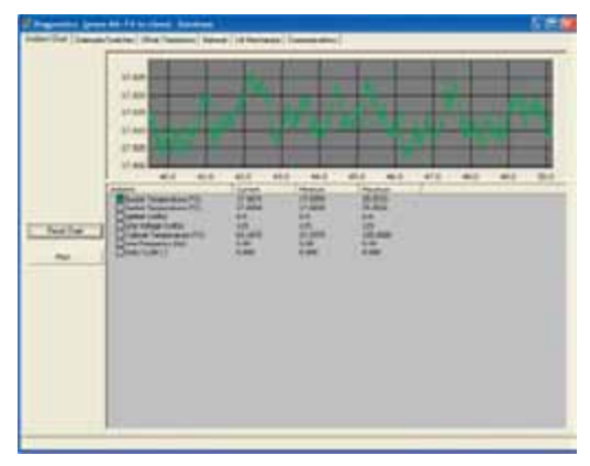
Monitor real-time internal component readings