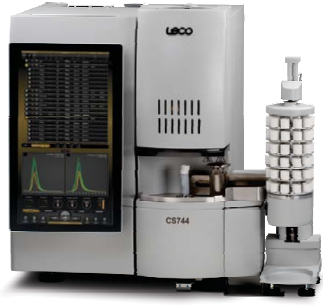
CS744 with optional autoloader