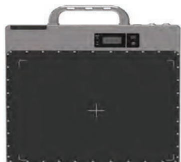
SCANSILC 2430 EOD