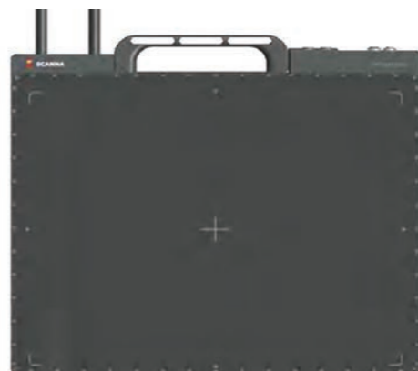
SCANSILC 3643 EOD

Scanna's Scansilc EOD Imagers are only 2.15 cm thick and are available in 2 sizes – compact 24 x 30 cm and larger area 36 x 43 cm. Unlike other most other x-ray systems that come from the medical field, Scansilc panels are specially designed to be high shock and impact tolerant with dust and water resistance to IP67 and a load bearing weight of 170 kgs. There are no moving parts or scanning mechanisms inside the panels.