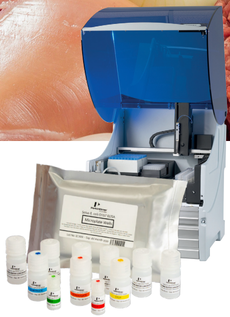
Solus E. coli 0157 ELISA Assay and Automated Workflow Package