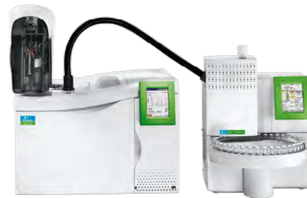
Clarus® 590 with Turbomatix Headspace

A typical application of a GC-HS system is the easy and accurate quantification of residual solvents.