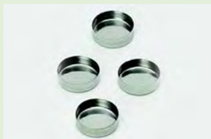
Thermal Analysis Consumables