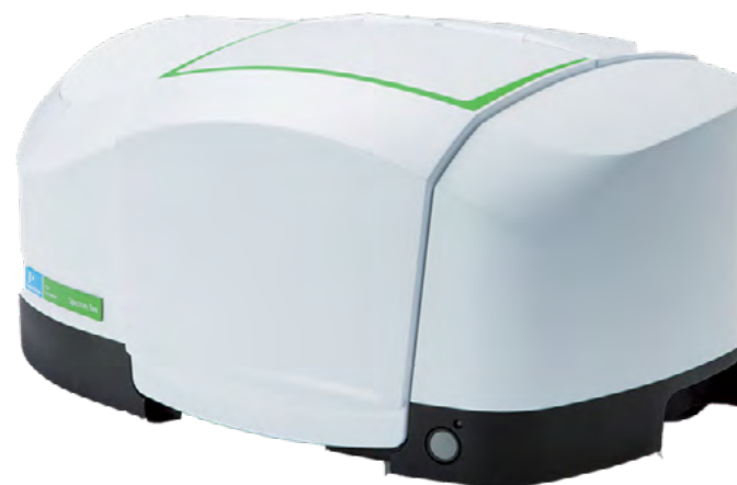
Polymer ID Analyzer

Accurate verification of identity, quality, and composition of polymers and their blends used in industries such as packaging, construction, and automotive is essential to developing new products and ensuring finished product quality. Our Polymer ID Analyzer is a compact, easy-to-use solution designed to simplify and accelerate your polymer analysis. You can quickly and confidently identify unknown polymer samples, determine composition of blends, and verify quality.