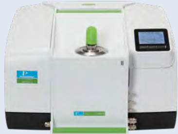
Spectrum 3 with Integrated EGA 4000