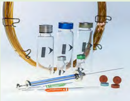
GC Instrument and Laboratory Consumables