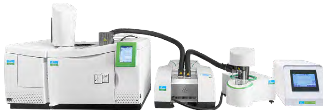
TGA 8000-Spectrum3 - Clarus S90 GC/MS

Good things happen when great technologies connect. Our hyphenated solutions couple two or more instruments to increase the power of analysis and save time by acquiring more information from a single run. Our TGA and STA systems, coupled with FT-IR, MS, or GC/MS systems, deliver the industry's most complete line of advanced evolved gas analysis (EGA) platforms for materials characterization in polymers, chemicals, and rubber. Its applications include identifying and quantitating components in polymers, determining leachables in packaging, and identifying phthalates in PVC samples.