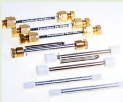
Thermal Desorber Tubes