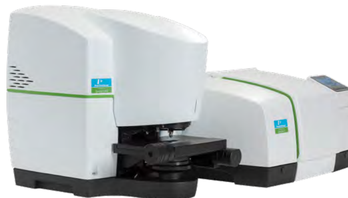
Spectrum 3 FT-IR with Spotlight 400 Imaging System

Our comprehensive multirange FT-IR solutions are intuitive to operate, making everything from spectral collection to processing and reporting simple and straightforward. The solutions are highly automated, eliminating time-consuming manual adjustments. The same interferometer platform used in every FT-IR instrument also powers our imaging and microscopy technologies. The microscopy system utilizes a high-performance single-point detector to deliver the best sensitivity. And it's highly automated, eliminating time-consuming manual adjustments to focus, aperture, and region-of-interest location.