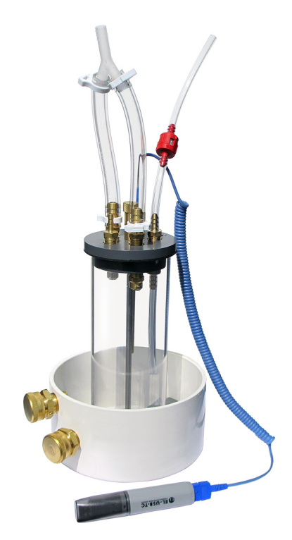
The RAD AQUA accessory

This accessory enables users to accurately measure radon in large water samples of up to 2.5L in volume, collected in standard soda bottles or glass jugs. Large samples allow for greater precision and lower limits of detection. Radon concentrations of as low as 1 pCi/L (37 Bq/m³) can be detected with a sufficiently large sampling bottle. The upper operating limit of the Big Bottle System is 10,000 pCi/L (370,000 Bq/m³). Ranges higher than that are detectable with the RAD H_2O accessory.