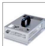
SUCTION CAP AND DRIP TRAY