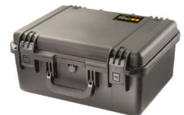
Transport & Storage Case Option

NOTE: This instrument is considered HAZMAT and requires HAZMAT training to ship. Please see the instrument manual for details.